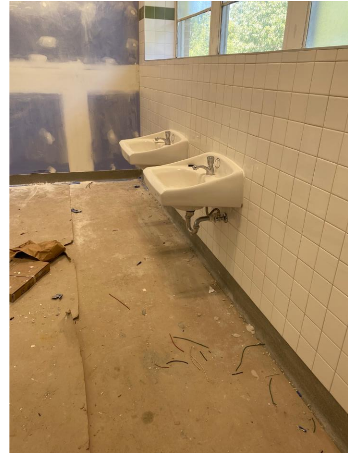
3rd Set of Student Restrooms in Progress