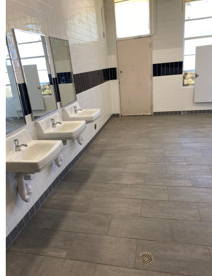
Boys and Girls Restroom Completed